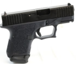
390: POLYMER MODEL P80 SEMI AUTO PISTOL

9MM, SERIAL# PF940V2, 4 1/2" BARRELRegistration:Terms:THIS GUN REQUIRES REGISTRATION OR AN FFL TRANSFER TO PURCHASE