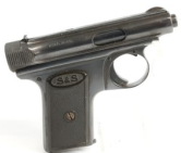
405: J.P. SAUER AND SOHN SEMI AUTO PISTOL

380-9MM CAL, SERIAL# S061860, 3" BARREL, IN STAINLESSRegistration:Terms:THIS GUN REQUIRES REGISTRATION OR AN FFL TRANSFER TO PURCHASE