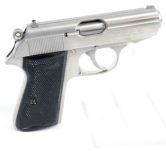
404: CARL WALTHER PPK

9MM, SERIAL# A841170, NO CLIP, 4" BARRELRegistration:Terms:THIS GUN REQUIRES REGISTRATION OR AN FFL TRANSFER TO PURCHASE