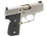
401: KAHR MODEL MK40 SEMI AUTO PISTOL

9MM, SERIAL# THF-0000, 3 1/2" BARREL, IN STAINLESSRegistration:Terms:THIS GUN REQUIRES REGISTRATION OR AN FFL TRANSFER TO PURCHASE